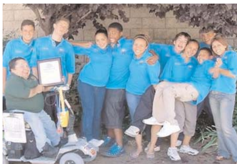
Club receives national award for its Inclusion program

lifetime relationships and interests, develop interpersonal skills, and complement the family unit in a safe and nurturing environment. Every year the Club receives more than 86,000 visits. The Boys & Girls Clubs of National City is one of the few youth development agencies based in National City, one of the poorest cities in the nation and much in need of positive programs for youth. The Club receives support from local donors and from people who once lived in National City and were served by the club. In their 55 years of operation, the Boys & Girls Clubs of National City has helped many young people go