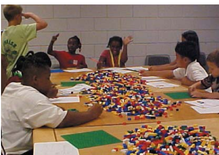
"Academy of Engineering" program - only one of its kind in the state

on to pursue fulfilling and successful lives, and they have gained many friends and loyal supporters. Their endowment fund helps to ensure that their doors will remain open for many years to come.